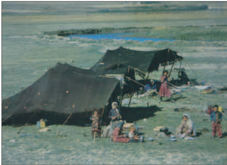
LEFT: It was a tough life in the rugged and unforgiving countryside of Kurdistan with tribes using makeshift tents as their homes.