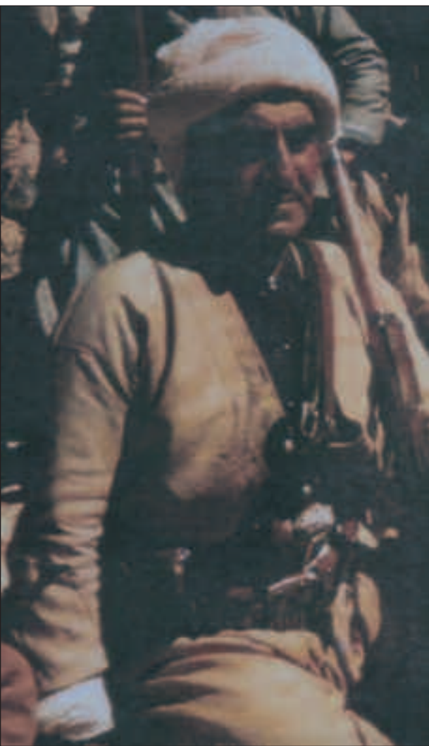
Kurdish leader Mustafa Barzani fought against the Iraqis in 1946.